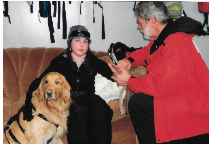
Rendering first aid at top patrol with Whitney, the avalanche patrol dog.

“I became a hill leader for the Homewood Mountain Resort at Lake Tahoe and was chosen as the outstanding patroller for the 1995 season. I became both a toboggan instructor and emergency care instructor and was the testing and training adviser until my retirement. During that time Homewood Mountain Resort was selected as the outstanding small patrol in the National Ski Patrol organization. Again I attribute my success from the commitment and training in Tang Soo Do.”