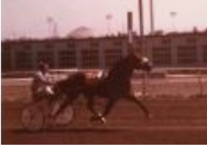
First Qualifying race at Cal-Expo race track in Sacramento, CA