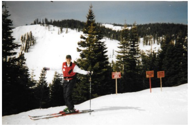
Patrolling at Homewood Mountain Resort Lake Tahoe, Nevada

His advice to beginning martial artists, “If you want to do it, commit yourself to it and make it happen. Look forward to achieving the goals you’ve set. Be proud of the organization, it’s got a lot of great people in it.”