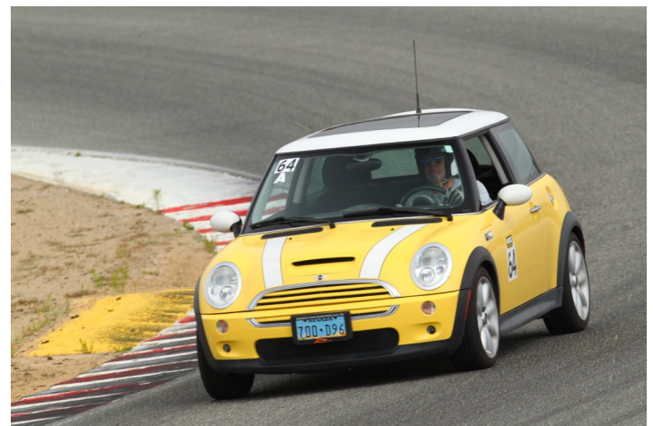
“My new hobby, driving my cooper on track day at Laguna Seca Raceway, Monterey, CA”